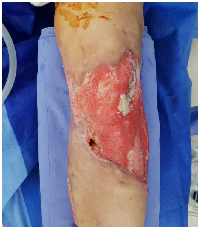
Fig. 1. A soft tissue (20.0 cm×15.0 cm) defects above the knee following several debridement, with significant patella tendon exposure on anterolateral side of the knee.

injury resulting from a traffic accident. After several surgical debridements, the resultant defect measured 20.0 cm × 15.0 cm with significant patella tendon exposure (Fig. 1). Prior to surgery, a perforator pedicled propeller flap using a musculocuta-