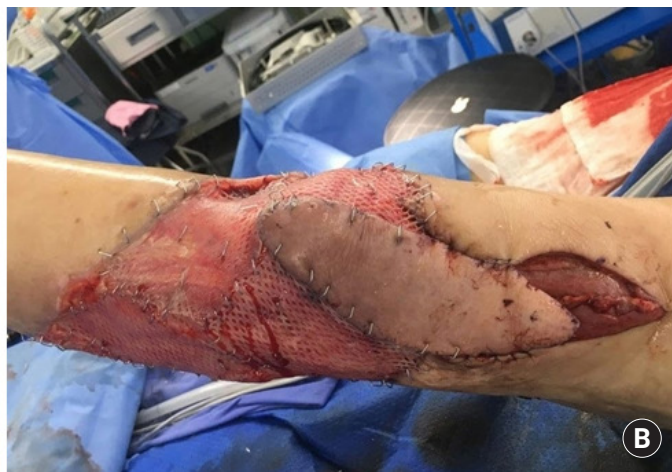
Fig. 2. (A) A pedicled reverse-flow anterolateral thigh flap (12.0 cm×4.0 cm sized) was harvested using musculocutaneous perforator of descending branch of the lateral circumflex femoral artery (LCFA). Descending branch of the LCFA and the perforator to the flap was dissected intramuscularly. (B) The pivot point was determined at about 8 cm above the knee joint and the pedicled reverse-flow anterolateral thigh flap was advanced to cover the patella tendon exposure area.