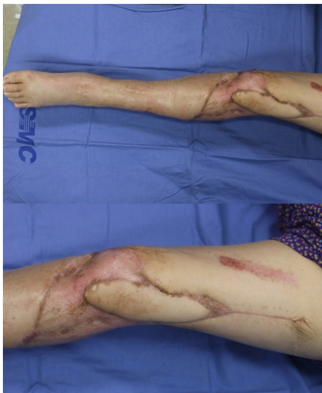
Fig. 3. Photograph of the flap at 3 months of follow-up. Satisfactory healing and contour achieved.

Coverage of traumatic soft-tissue defects around the knee remains a challenging problem for reconstructive surgeons because of a lack of an adequate recipient vessel in anterior, lateral knee area and the need for a thin, pliable knee joint coverage. Various options have been utilized to provide soft tissue reconstruction for these defects. The use of a free flap is not always preferable in this region, due to high donor site morbidity, long surgical time, and difficulties associated with selecting an appropriate recipient vessel positioned deeply around the knee. Pedicled muscle flaps have been the workhorse for coverage of defects around the knee for decades. The gastrocnemius muscle flap has proved to be the most reliable, safest, and easiest surgical option [6]. However, perforator flaps have recently revolutionized soft tissue reconstruction around the knee, due to low donor morbidity and available pedicle length. Gravvanis et al. [7] demonstrated the use of a pedicled reverse-flow ALT flap for knee reconstruction and considered it super to the gastrocnemius muscle flap, because of its greater size, shape, and flexibility, better color and texture match, and less bulkiness. Furthermore, pedicled reverse-flow ALT flap have arcs of rotation